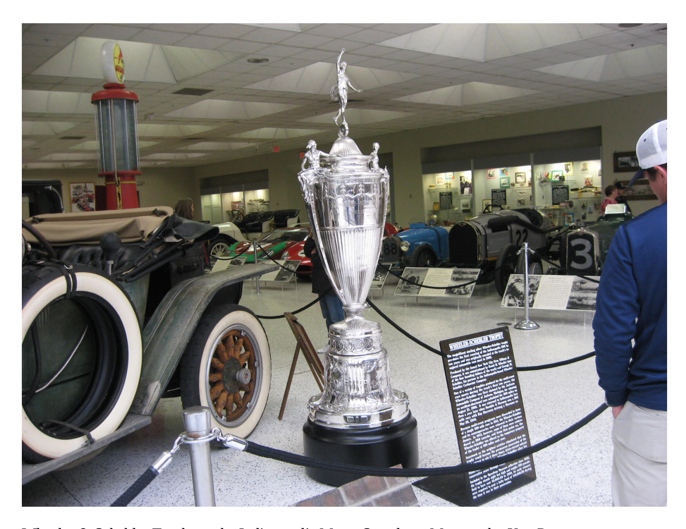
Wheeler & Schebler Trophy at the Indianapolis Motor Speedway Museum